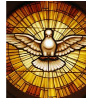
Thought for the Week

Page 288 Parish Mass Book Psalter Week 1 Year A